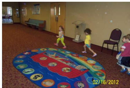
Skipping to a song.

We went to secular music with Miss Beth.